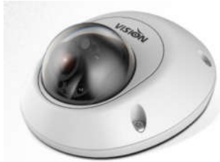
Built in Mic: Interior camera